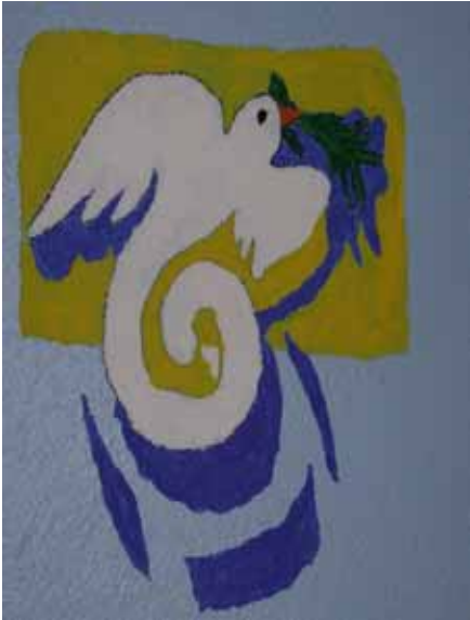
(This art was done by one of our teenage youth in the Tower room)

God our Father Jesus our Savior We are Lifted Up!!