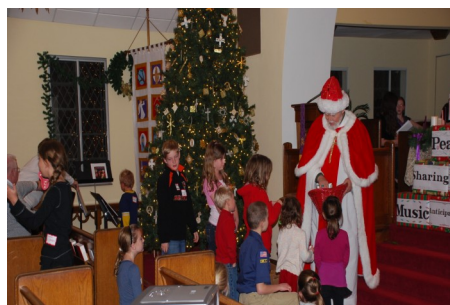
St. Nicholas visited and we learned about 10 special gifts of Christmas

Enjoy the Photo Gallery about our evening.