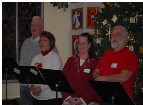
We sang lovely Christmas Carols— Even creating motions for some.

The study group will meet at 7 PM on Mondays, beginning Jan. 3, 2011. Please sign-up if interested in joining this study. The book cost will be $10.99 plus shipping for William Barclay's bible study guide.