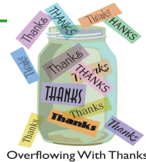
Overflowing With Thanks